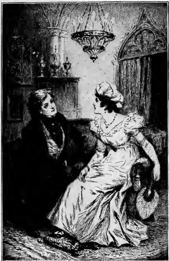
We spent about an hour in familiar talk